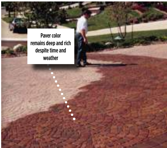
Paver color remains deep and rich despite time and weather