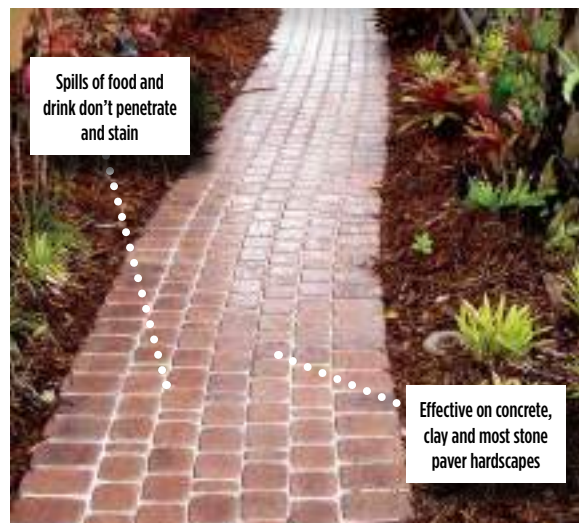
Spills of food and drink don't penetrate and stain