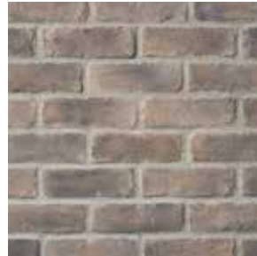
USED BRICK Talbot 1114-07