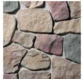
EASTERN FIELDSTONE Stonehill S6015-5