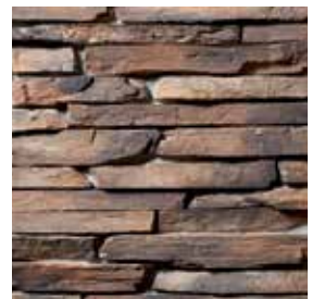
MONTANA LEDGE Leather Brown S4650-8