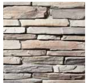
MONTANA LEDGE Suede Gray 54630-8