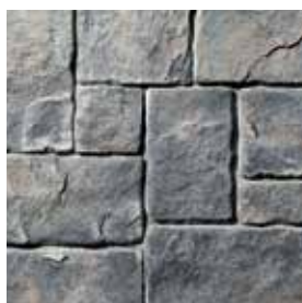
BAVARIAN CASTLE Norwich S6250-5