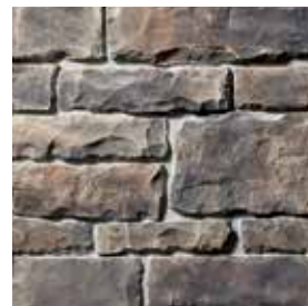
OHIO RUBBLE Stonehenge S4775-4