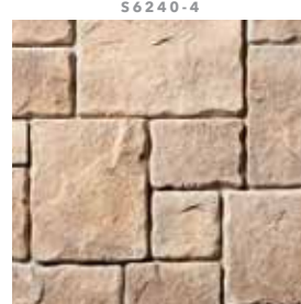
BAVARIAN CASTLE Westwood S6230-4