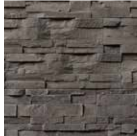
LONG ISLAND STAK* Steamburg* S6340-17