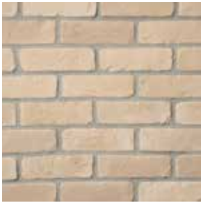
USED BRICK Buff 1104-8

Captures the appearance of old-style, hand-crafted brick.