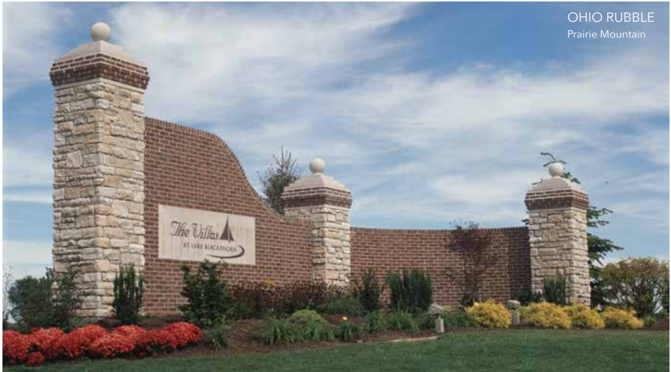
OHIO RUBBLE Prairie Mountain