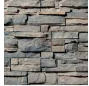
FAST STAK* Cheyenne Ridge S5050-8