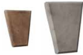
Keystone Sand Finish

SIZES: 2 1/2" thick, large 12", small 8" COLORS: Antique Tan, Arkansas, Cheyenne, Harvest Wheat, Light Gray, Ponderosa, Tivoli