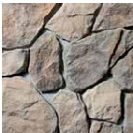
EASTERN FIELDSTONE Walden S6025-5