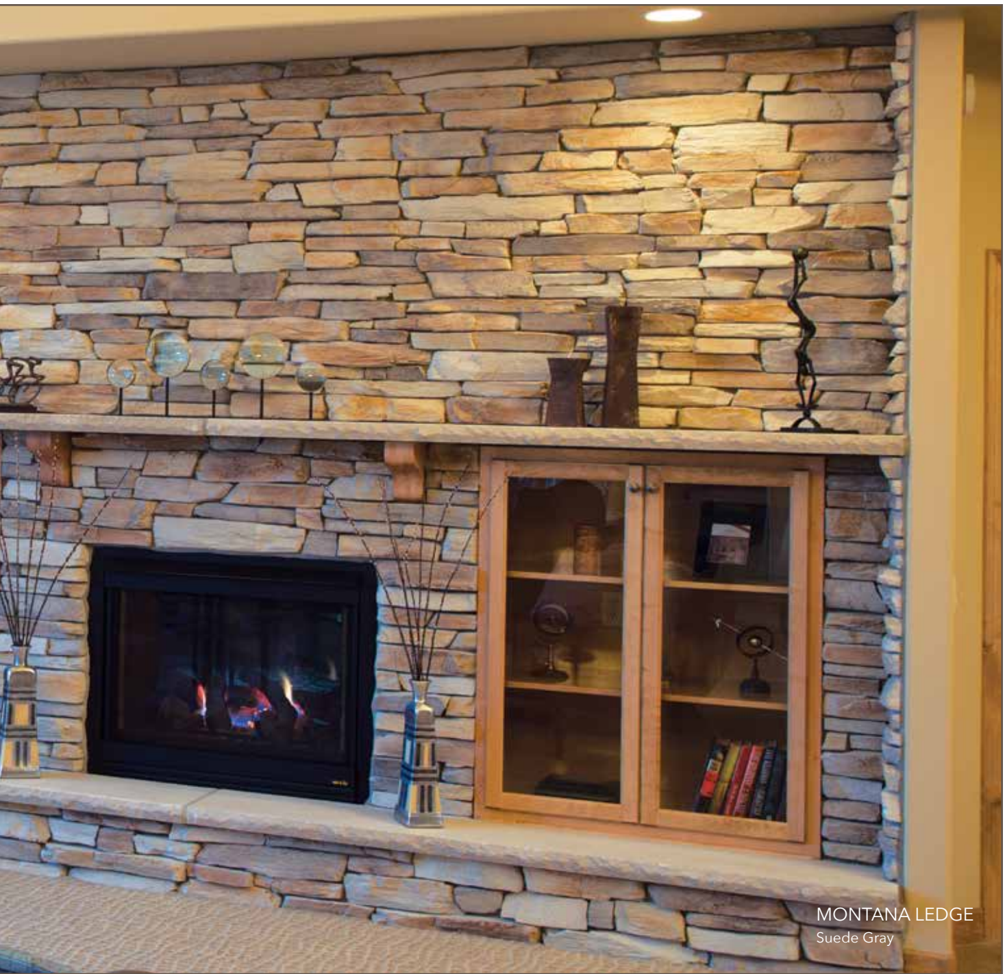
MONTANA LEDGE Suede Gray