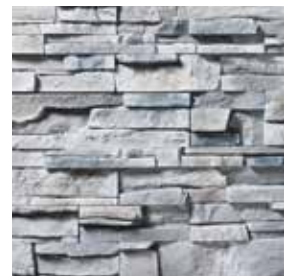
FAST STAK* Arctic Gray S5065-16