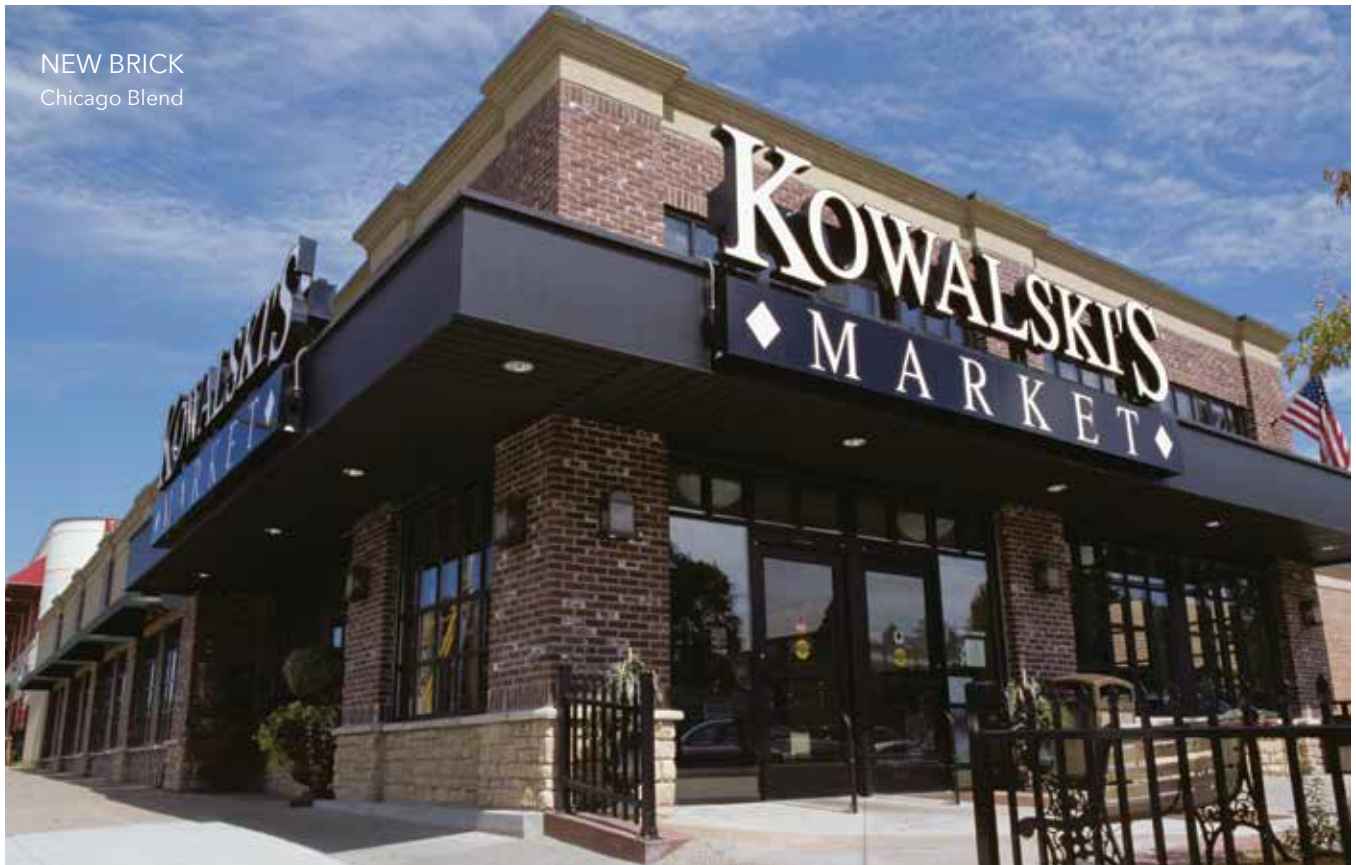
NEW BRICK Chicago Blend