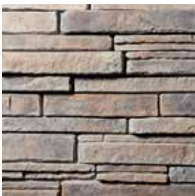
BLUFFSTONE Easton S4835-5

Varying thicknesses with simple striations and a wind eroded, stacked appearance.