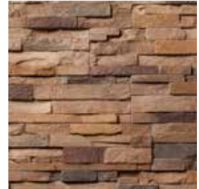
LONG ISLAND STAK* Woodridge S6390-09

*These items are special order only. Contact your local dealer or Boulder Creek Stone for lead times.