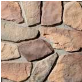
EASTERN FIELDSTONE Burnt Hollow S6005-09

The irregular, full-faced pieces continue to impress with a variety of shapes and colors.