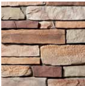
SOUTHEASTERN LEDGESTONE Butternut S6165-5