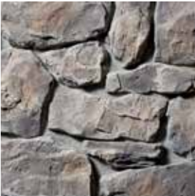
ITALIAN FIELDSTONE Tivoli