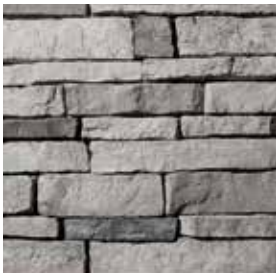
PRAIRIE BLUFF Mesquite S5895-10