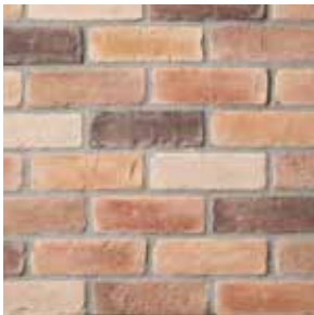
USED BRICK Chicago Used 1100-8