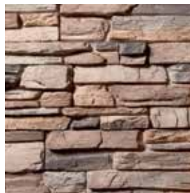
WESTERN LEDGE STAK* Appaloosa S4900-2

A groutless pattern, it has the most depth giving it a rough and rugged Western feel.