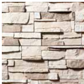
FAST STAK* Jaffa Beige S5040-9