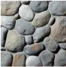
RIVER ROCK Natures Blend S4355-8