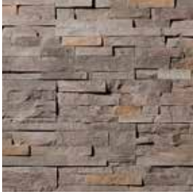
LONG ISLAND STAK* Alden S6385-09

A thin stone facing with deep and luxurious tones.