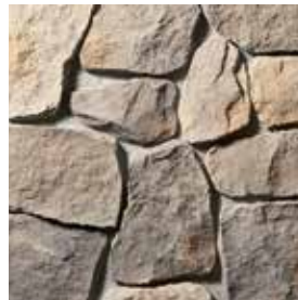
SPLITFACE Mansfield S4255-7