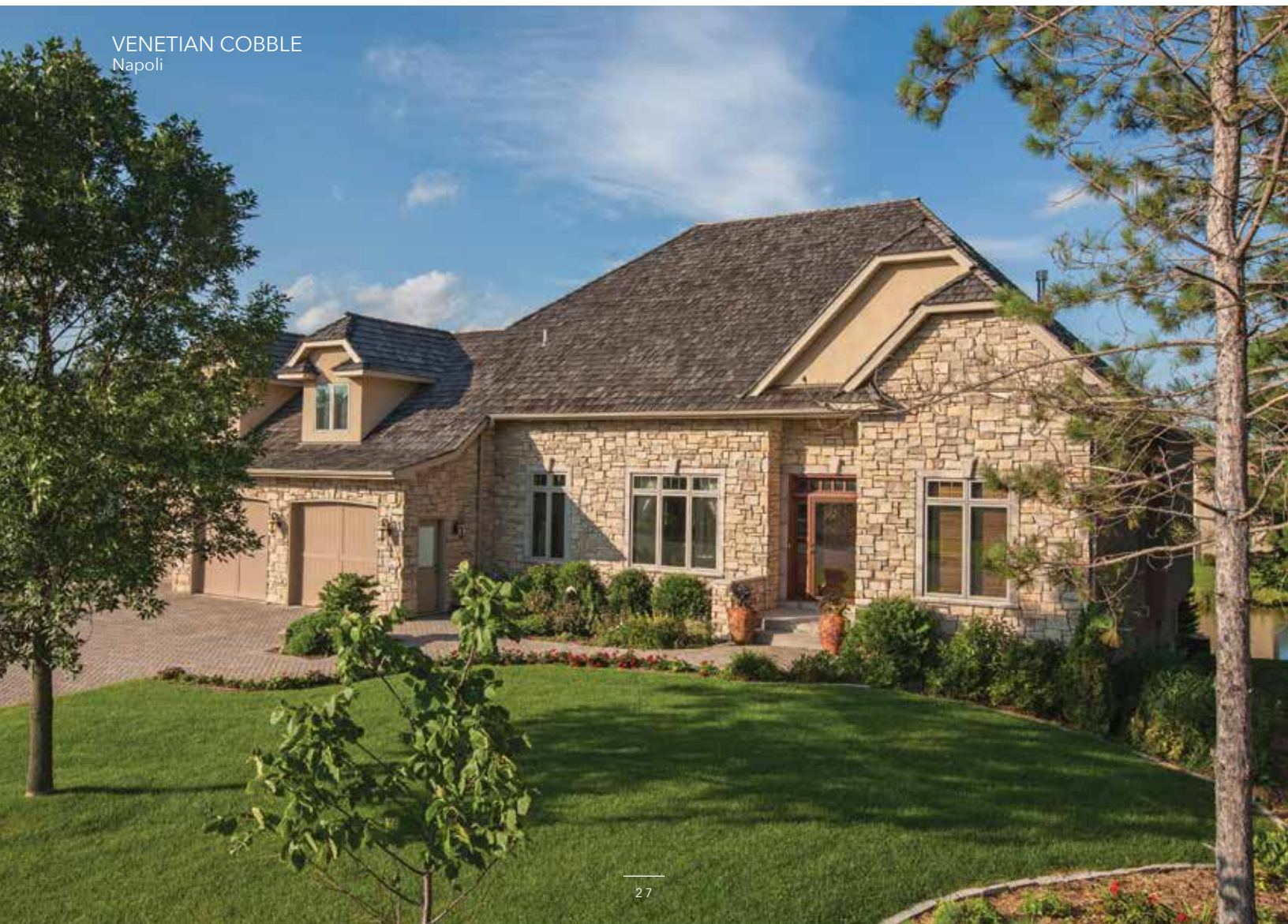
VENETIAN COBBLE Napoli