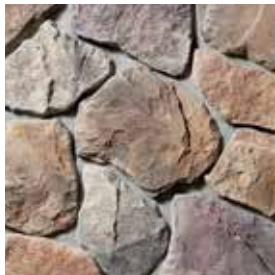
EASTERN FIELDSTONE Englewood S6000-5