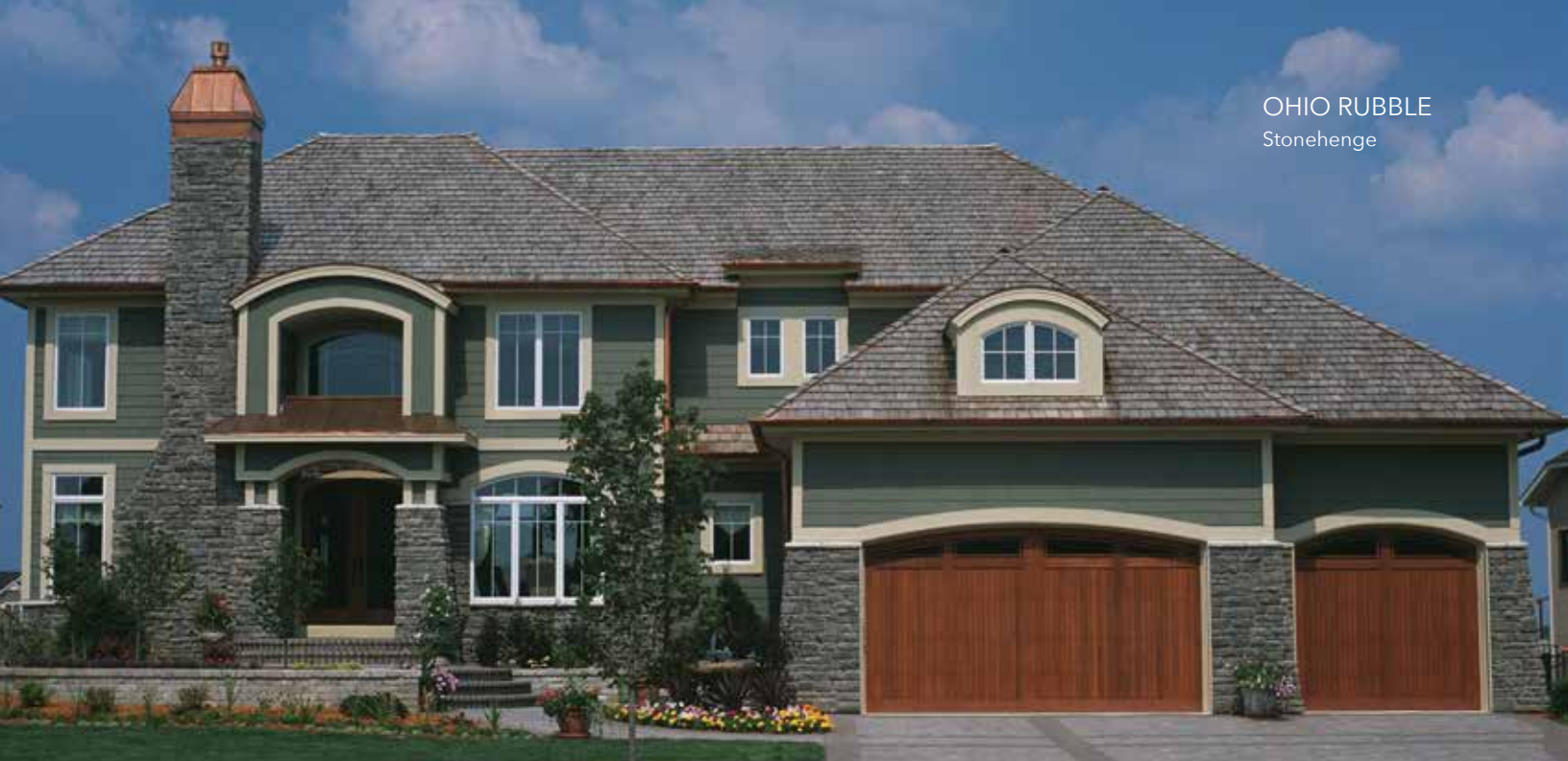
OHIO RUBBLE Stonehenge