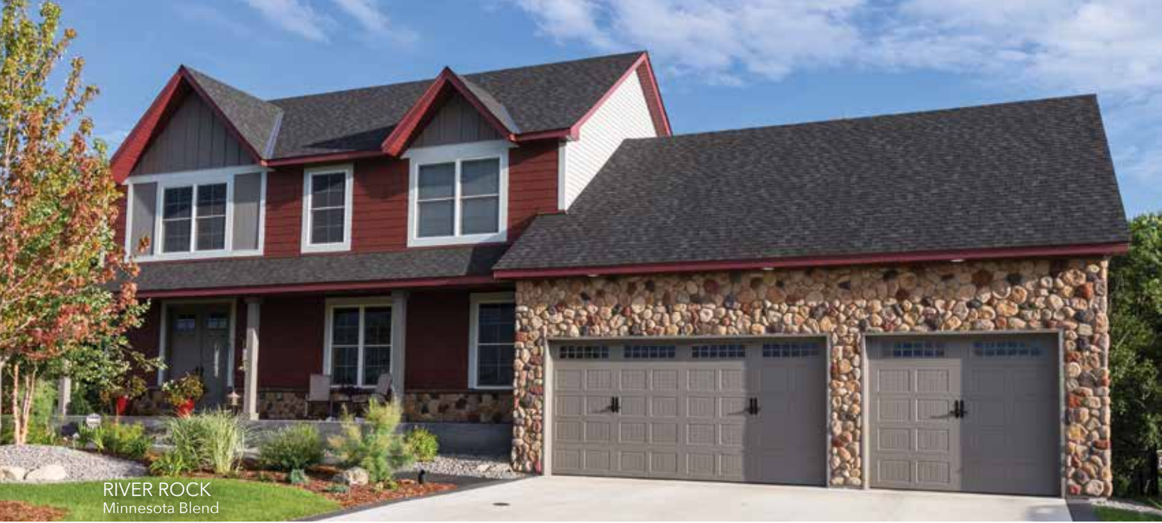
RIVER ROCK Minnesota Blend