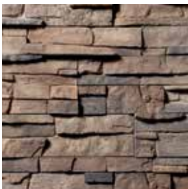
FAST STAK* Sable S5070-8