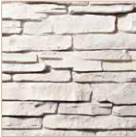
COUNTRY LEDGE Fossil Beige S4060-8