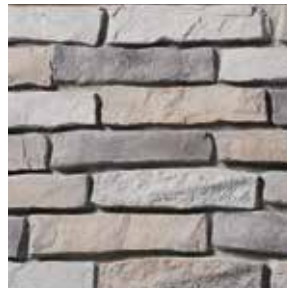
STONEBRICK Linden 2506-07