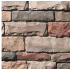
OHIO RUBBLE Monroe S4715-7