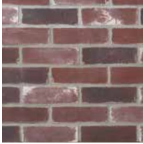
NEW BRICK Chicago Blend 2114-8

Replicates the look of a new brick with no pock marks or irregular shapes.