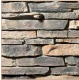
COUNTRY LEDGE West Chester S4095-7