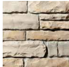
OHIO RUBBLE Prairie Mountain S4720-8