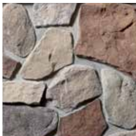
SPLITFACE Willows S4285-0