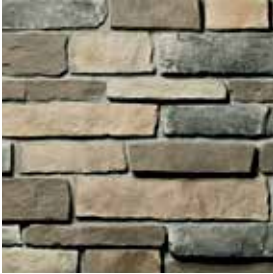
PRAIRIE BLUFF Winslow S5845-14