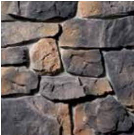
ITALIAN FIELDSTONE Toscana