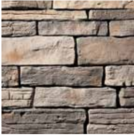
WEATHERED EDGE Bristol S5140-7

The authentic stratification appearance of centuries old stone adds visual interest to any exterior.