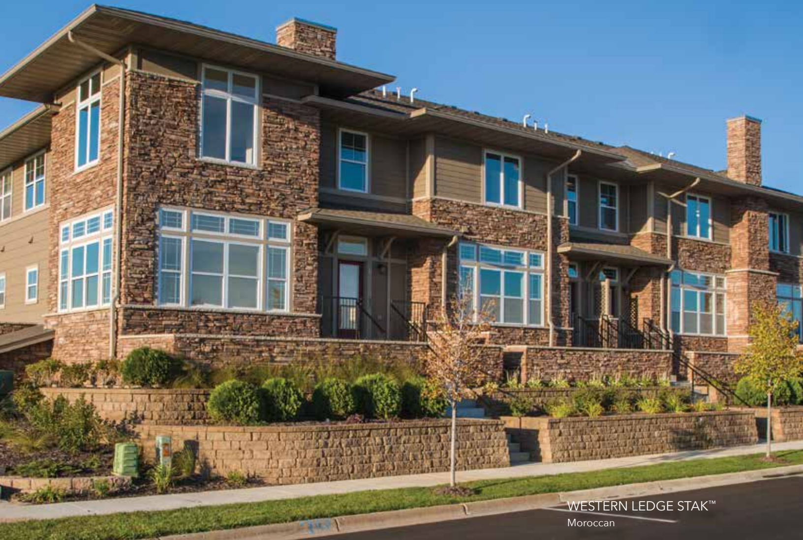
WESTERN LEDGE STAK™ Moroccan