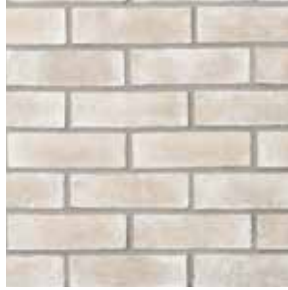
NEW BRICK Dover 2112-8