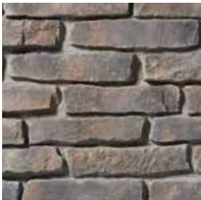
STONEBRICK Beringer 2501-07

The hybrid of stone and brick, it has irregular shapes and jagged edges.