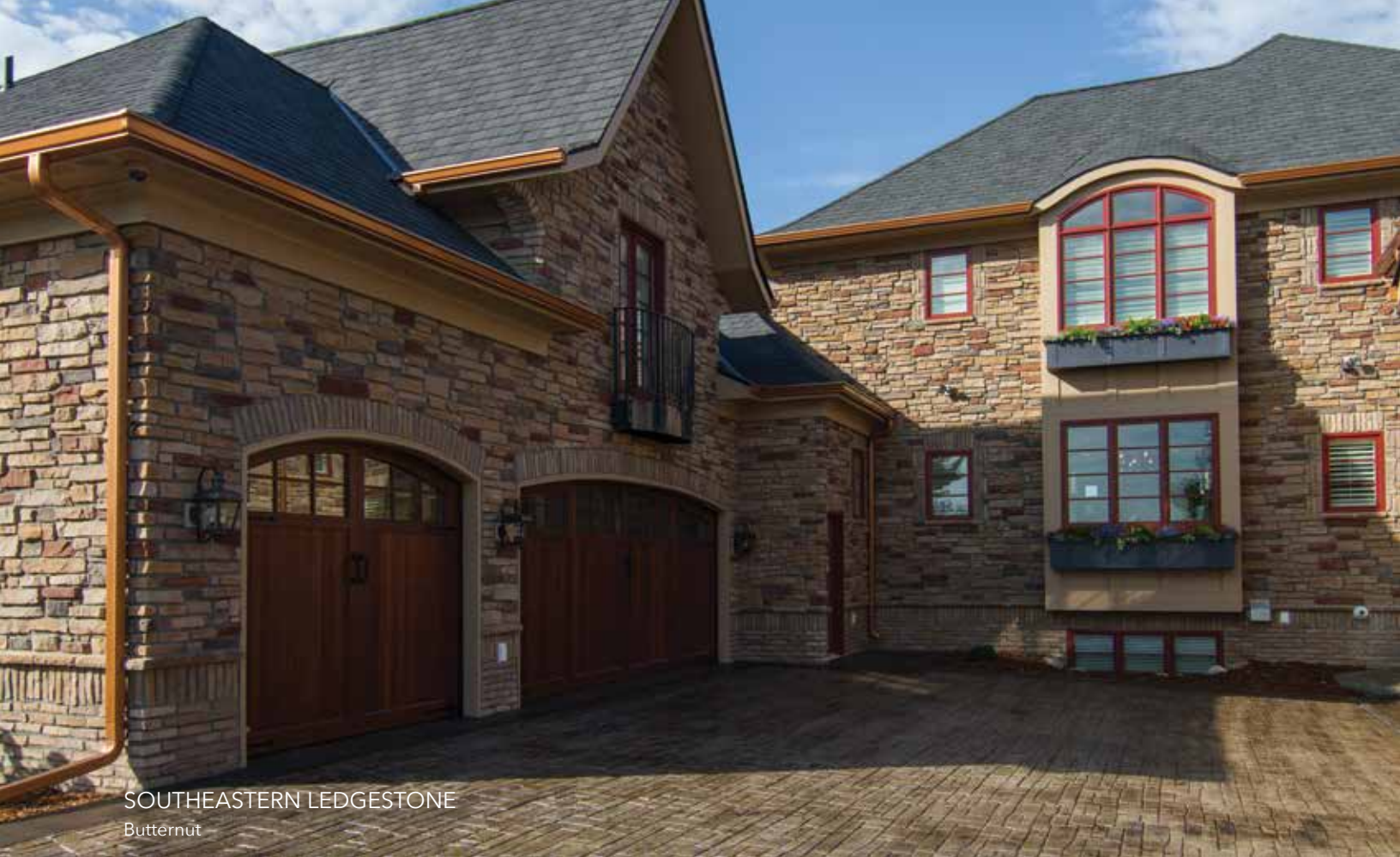
SOUTHEASTERN LEDGESTONE Butternut