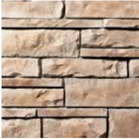
SANGRIA Castano S4200-8

The softer rectangular shape replicates the look of quarried stone with a chiseled face.