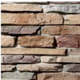
CLIFFSTONE Apache S5170-0

Linear and jagged appearance with longer horizontal stones.