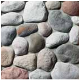
RIVER ROCK Comfort Blend S4330-8

A natural, semi-rounded tumbled shape with varying shapes and sizes.