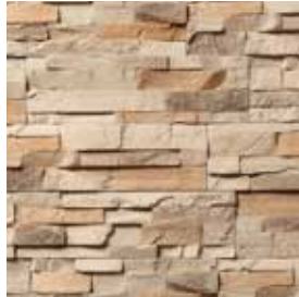
LONG ISLAND STAK* Niagara S6375-09