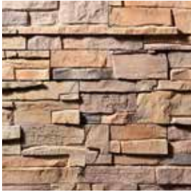
FAST STAK* Ancona S5005-7

An elegant, easy-to-install groutless pattern with a clean and textured appearance.