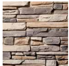
WESTERN LEDGE STAK* Belgian S4930-5