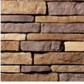
PRAIRIE BLUFF Mojave S5860-5