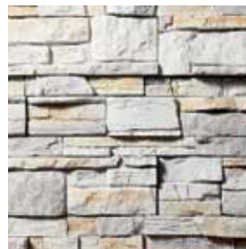
FAST STAK* Mirage Gray S5010-9