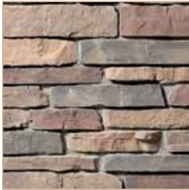
COUNTRY LEDGE Vancouver S4005-7