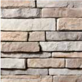
PRAIRIE BLUFF Laner S5820-0