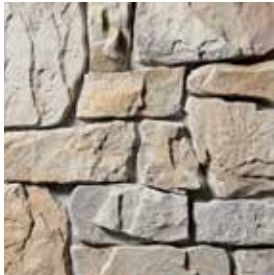
ITALIAN FIELDSTONE Venice