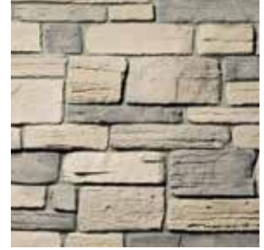
WEATHERED EDGE Portage S5145-14