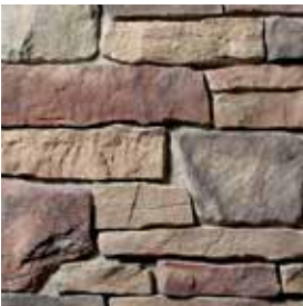
MOUNTAIN BLEND Comforts of Home S9030-6