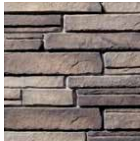
BLUFFSTONE Seneca S4830-4