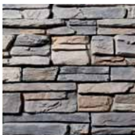
WESTERN LEDGE STAK* Lasino S4925-5