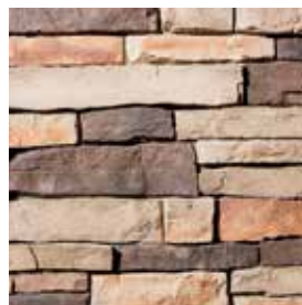
SOUTHEASTERN LEDGESTONE Tenor S6102-09