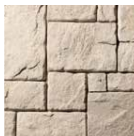
BAVARIAN CASTLE Antique Buff S6240-4

With large square-shaped pieces, it casts a unique, Medieval appearance.