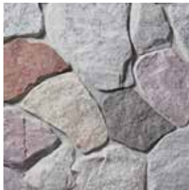
SPLITFACE Great Lakes S4250-8