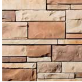
SANGRIA Saddle S4201-09