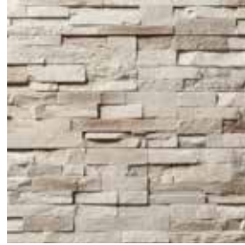
LONG ISLAND STAK* Cold Spring* S6345-17