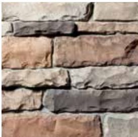
OHIO RUBBLE Hudson Bay S4760-0

A large and stately stone. Its chiseled face simulates a castle-like exterior.