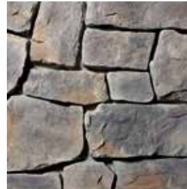
VENETIAN COBBLE Salerno S5915-5