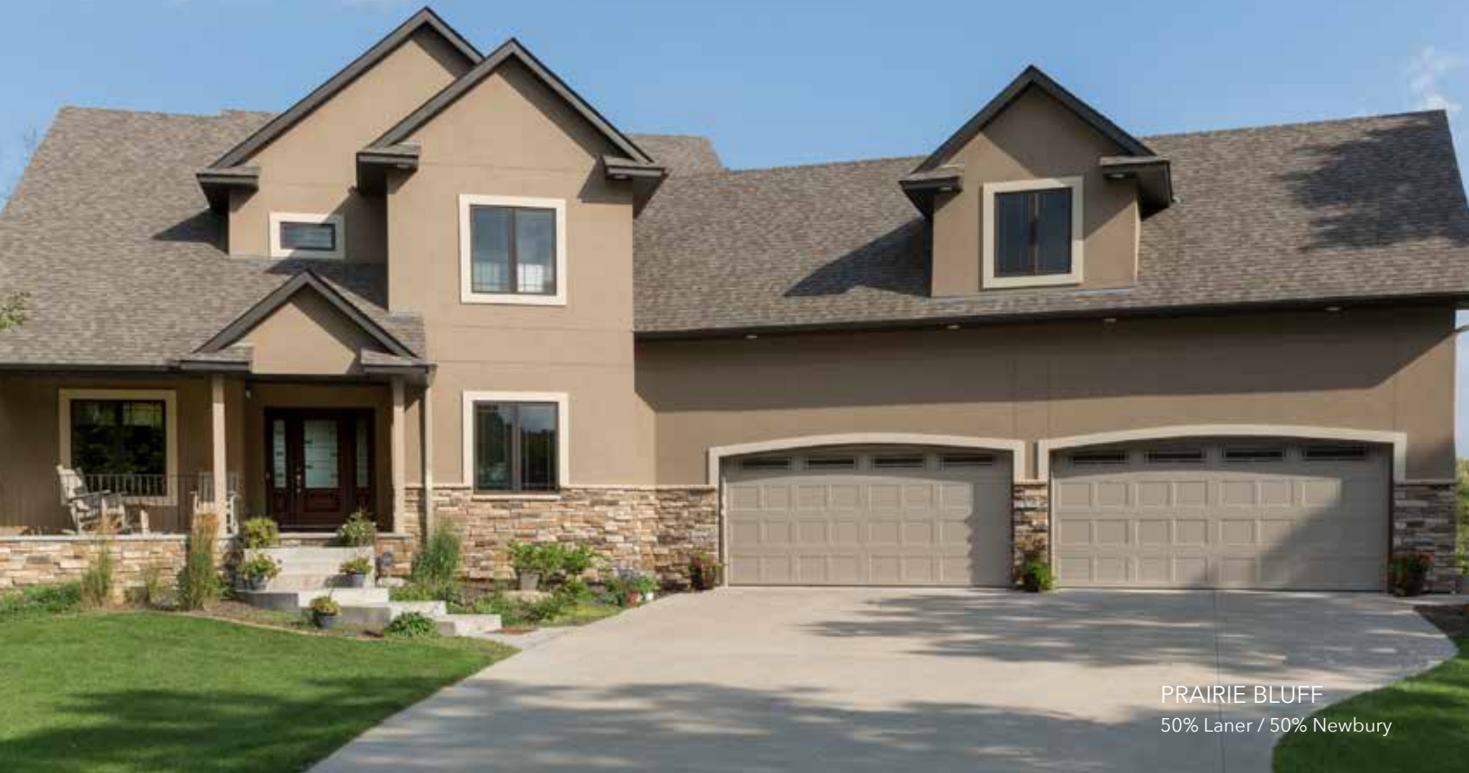
PRAIRIE BLUFF 50% Laner / 50% Newbury