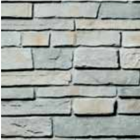
PRAIRIE BLUFF Chandler S5815-14