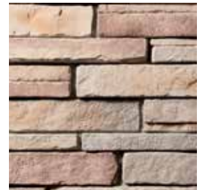
BLUFFSTONE Sunset S4820-8