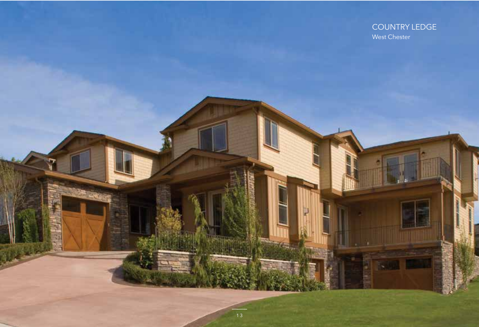
COUNTRY LEDGE West Chester