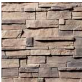
FAST STAK* Russet Brown S5090-6