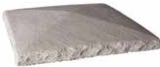
③ KEYSTONE Light Gray