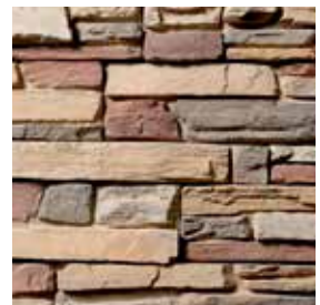
WESTERN LEDGE STAK* Mustang S4920-3