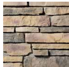
SOUTHEASTERN LEDGESTONE Wilmington S6175-5