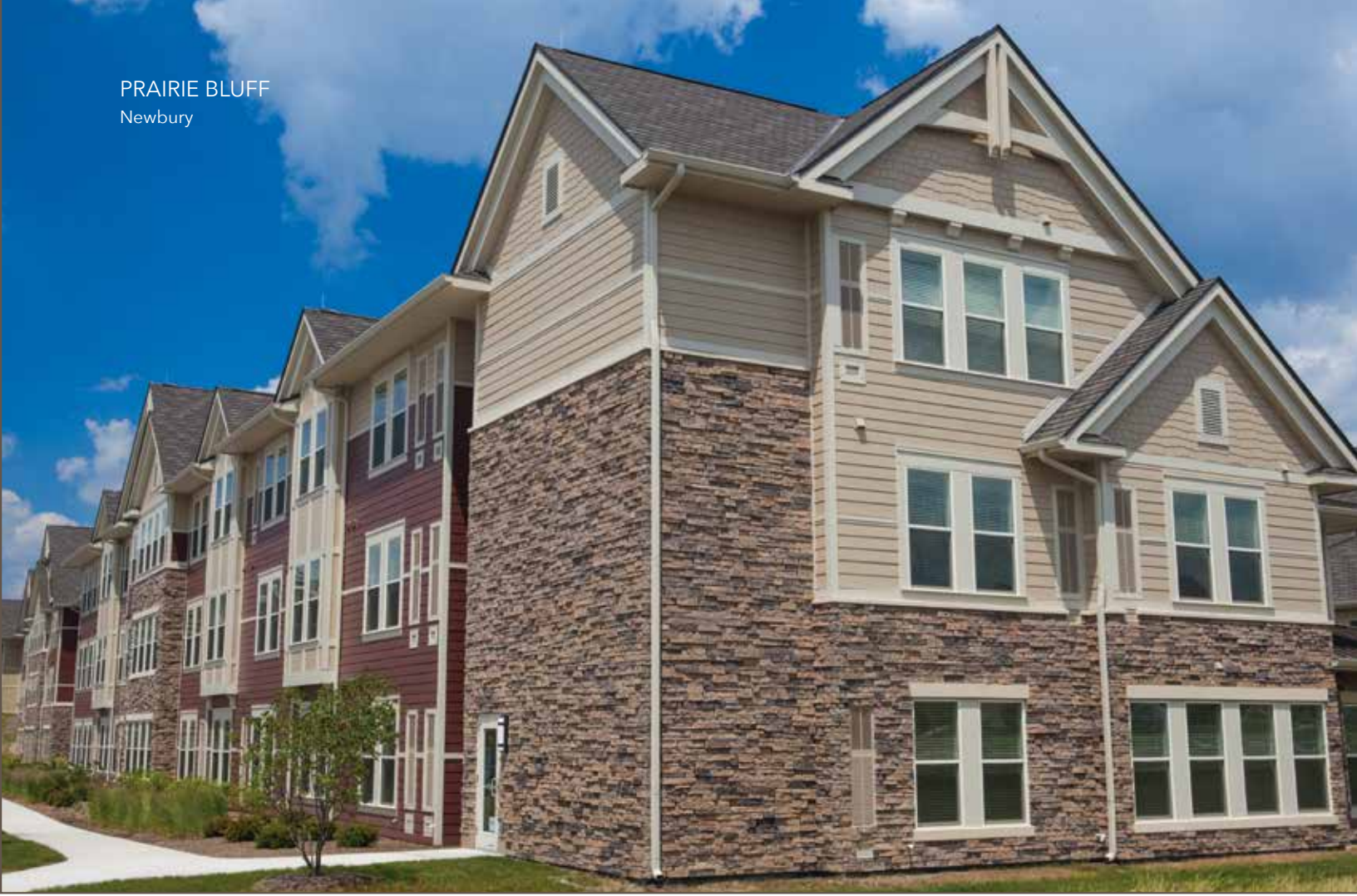
PRAIRIE BLUFF Laner / Newbury