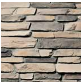
MONTANA LEDGE Pendleton 54645-14