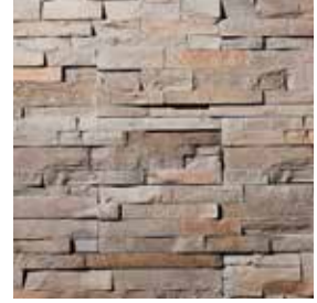
LONG ISLAND STAK* Hempstead S6365-10