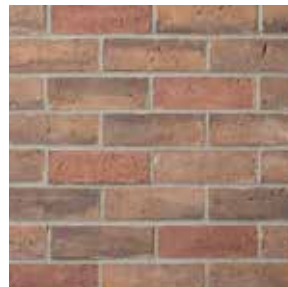
TRAVERTINE Mesa 2203-07