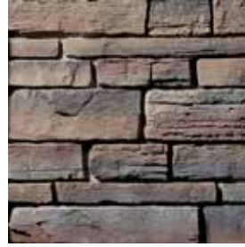
WEATHERED EDGE Kodiak S5120-0