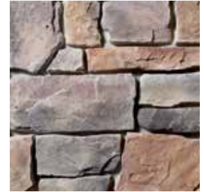
VENETIAN COBBLE Milan S5910-5