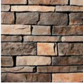
PRAIRIE BLUFF Prescott S5890-10