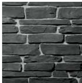
MONTANA LEDGE Jasper S4655-14