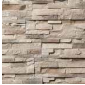
LONG ISLAND STAK* Berkshire S6350-17