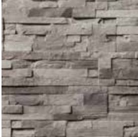
LONG ISLAND STAK* Kennedy S6355-17