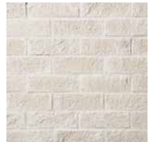
ESTATE Shelby 1204-07

A fairly flat appearance, but with a rough and bumpy surface texture.