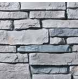
SOUTHEASTERN LEDGESTONE Misty Gray S6135-16