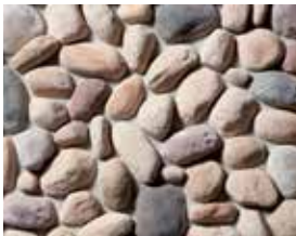
NUGGETS Superior S5600-9