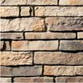
PRAIRIE BLUFF Newbury S5885-7