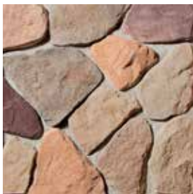
SPLITFACE Westin Willows S4275-08