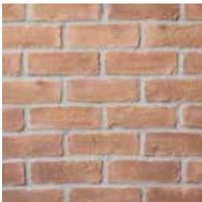
USED BRICK Lexington 1103-8