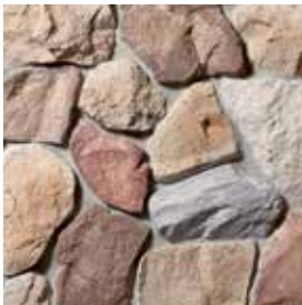
SPLITFACE Buckeye Blend S4260-8

The appearance of stones that have been split in two revealing colorful veins.