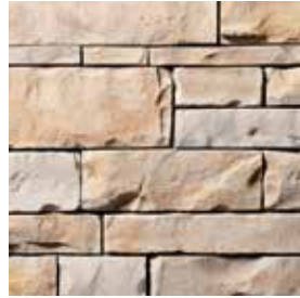
SANGRIA Pueblo S4245-5