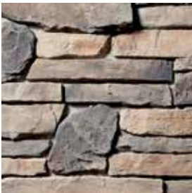
MOUNTAIN BLEND Barton S9040-7