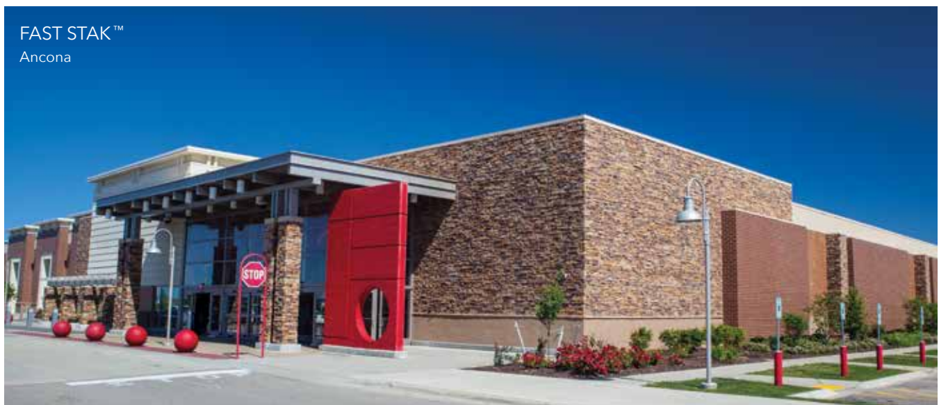
FAST STAK™ Ancona