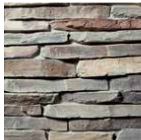
CLIFFSTONE Montour S5185-4