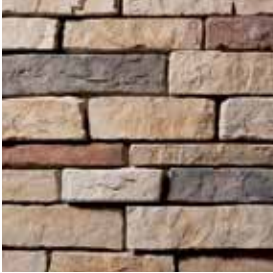
PRAIRIE BLUFF Navajo S5800-9