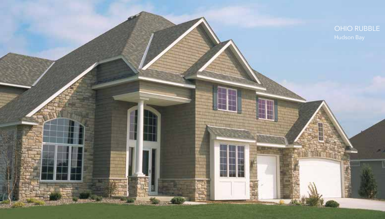
OHIO RUBBLE Hudson Bay