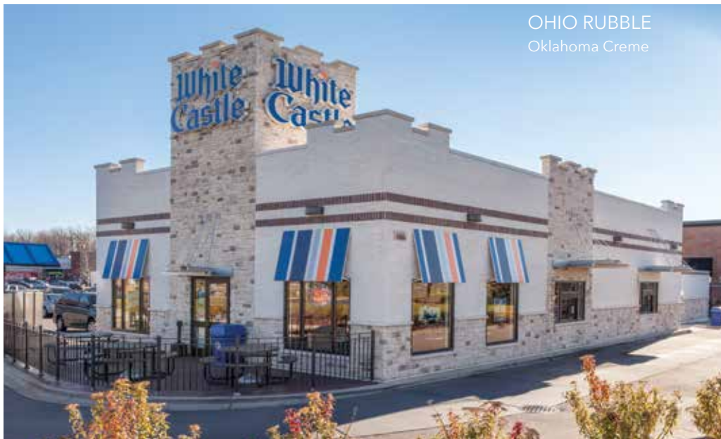
OHIO RUBBLE Oklahoma Crème