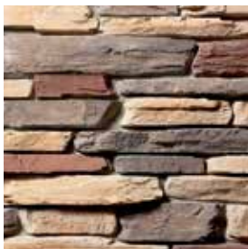
MONTANA LEDGE Cameron S4680-6