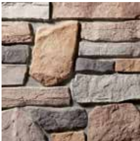
MOUNTAIN BLEND Athena S9035-7

Combines horizontal ledge stones with large fieldstones - Old World quality.