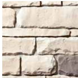
OHIO RUBBLE Oklahoma Crème S4750-9