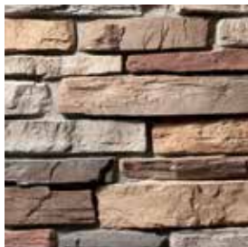
CLIFFSTONE Bradford S5190-7