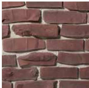
CLINKER BRICK Red 2600-8

Styled after the misshaped clinker bricks that are chosen for their unique look lacking traditional brick uniformity.