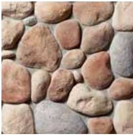
RIVER ROCK Desert Rust S4350-8