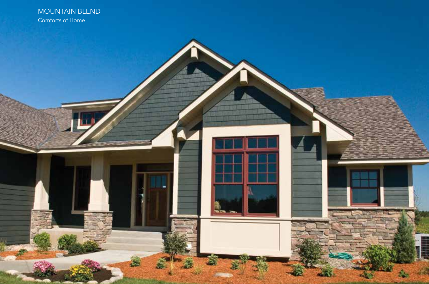
MOUNTAIN BLEND Comforts of Home

Always see a physical sample prior to purchase.