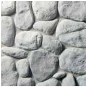
RIVER ROCK Mission S4315-08