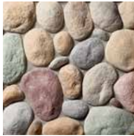
RIVER ROCK Northern Blend S4345-8