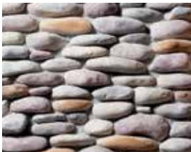
PEBBLESTONE River Bed S5400-8