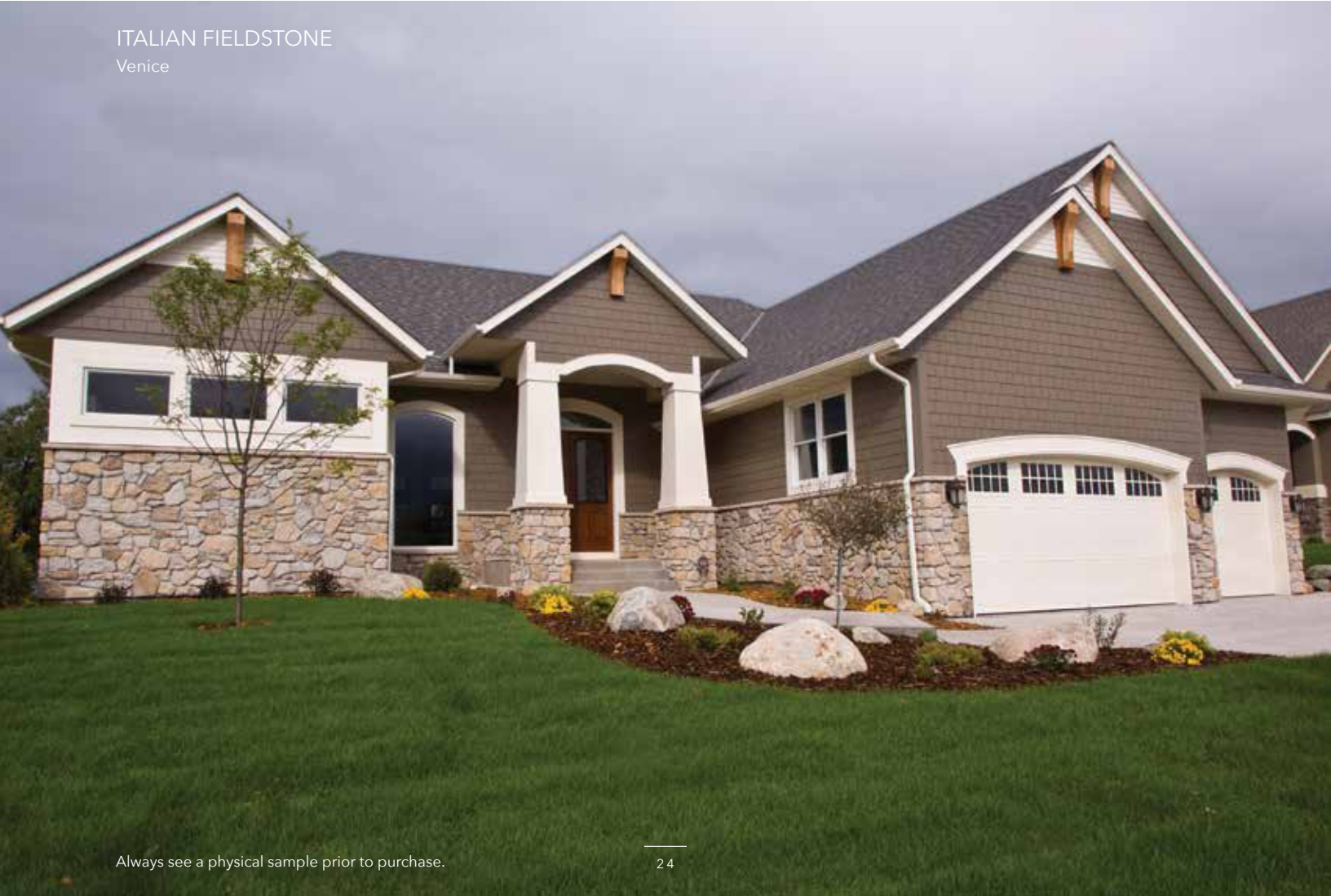
ITALIAN FIELDSTONE Venice