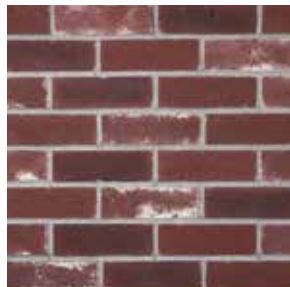
TRAVERTINE Elmwood 2207-07