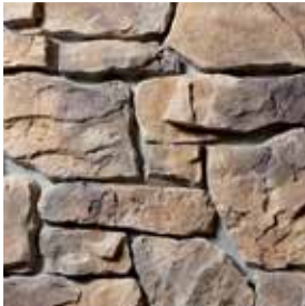
ITALIAN FIELDSTONE Bergamo

The new Italian Fieldstone is rugged, rustic and romantic.