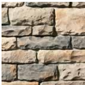
OHIO RUBBLE St. Claire S4705-7