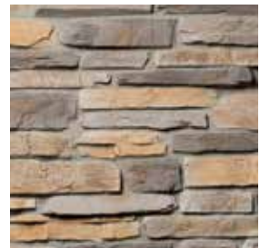
CLIFFSTONE Sheridan S5165-14