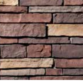
PRAIRIE BLUFF Red Mountain S5865-5