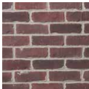
USED BRICK Old World 1106-8