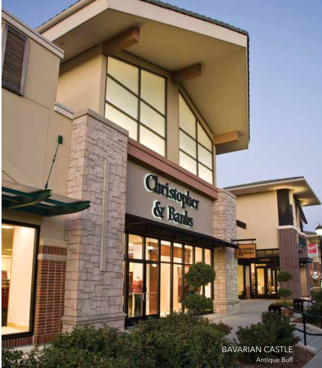
BAVARIAN CASTLE Antique Buff