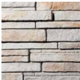
BLUFFSTONE Outback S4800-8