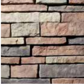
PRAIRIE BLUFF Varena S5875-6