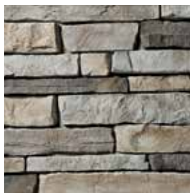
SOUTHEASTERN LEDGESTONE Quincy S6115-7