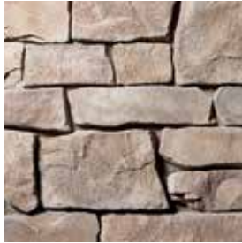
VENETIAN COBBLE Biella S5905-5

Large pieces with edges that have been sawn with a slightly uniformed rectangular shape.