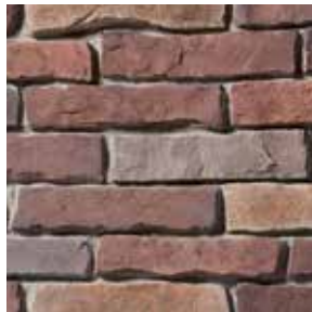
STONEBRICK Ferrara 2503-07