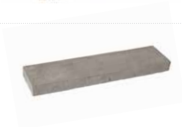
④ CHISEL FACED SILL Light Gray