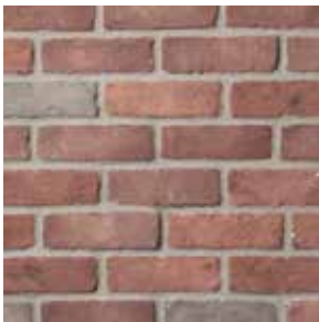
USED BRICK Essex 1112-07