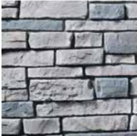
PRAIRIE BLUFF Alpine S5835-16

A natural, rectangular stone with a fairly weathered texture. An option to drystack.