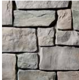
VENETIAN COBBLE Molise S5930-6