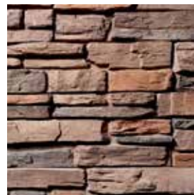
WESTERN LEDGE STAK* Moroccan S4910-3