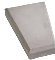
② LARGE FLAT SILL Light Gray