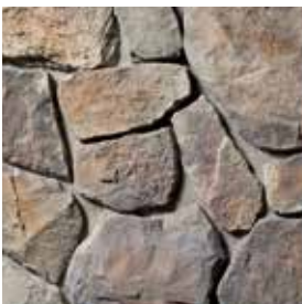
EASTERN FIELDSTONE Tishbury S6010-5