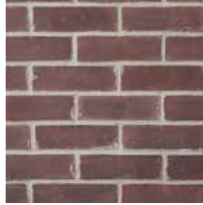
NEW BRICK Red Colonial 2110-8