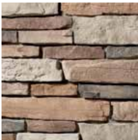
SOUTHEASTERN LEDGESTONE Barrington S6155-4

A mixture of large, rectangular shapes, it has some weathered edges and some striations.