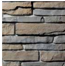
SOUTHEASTERN LEDGESTONE Cajun S6110-3