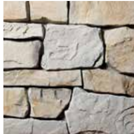
VENETIAN COBBLE Napoli S5900-5