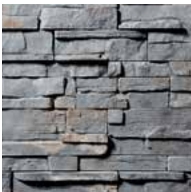
FAST STAK* Gunflint Gray S5020-9