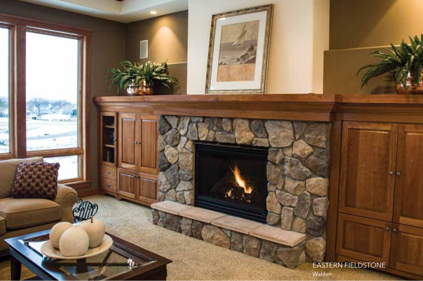
EASTERN FIELDSTONE Walden