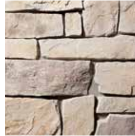
VENETIAN COBBLE Genoa S5920-5