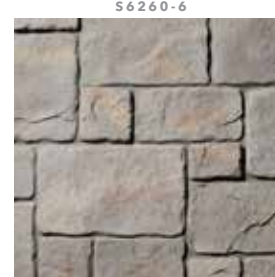
BAVARIAN CASTLE York Gray S6220-3