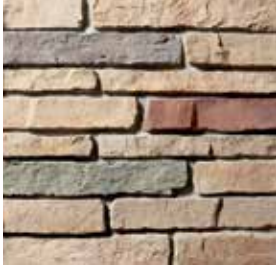
PRAIRIE BLUFF Yuma S5810-0