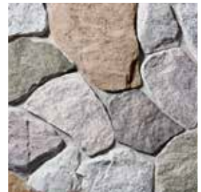
SPLITFACE Michigan S4290-1