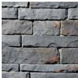
OHIO RUBBLE Smokey Hollow S4725-8