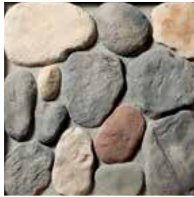
RIVER ROCK Mineral Gray S4320-5