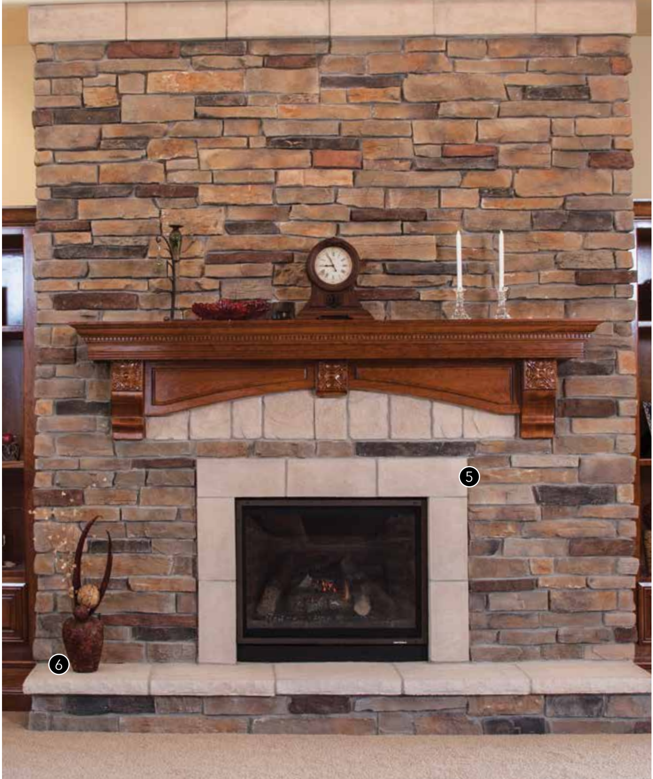
⑤ HEAVY DUTY FLAT SILL Antique Tan