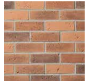
TRAVERTINE Pima 2205-07