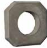
Octagon Light Trim

SIZES: 8" x 8" x 1 1/2" COLORS: Antique Tan, Arkansas, Light Gray, Ponderosa, Tivoli