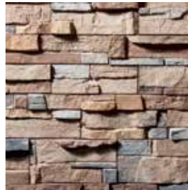
FAST STAK* Cashmere S5015-7