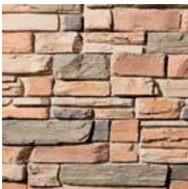
WESTERN LEDGE STAK* Burnt Hollow S4905-09