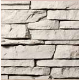
COUNTRY LEDGE Glacier Buff S4025-8