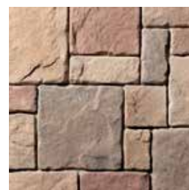
BAVARIAN CASTLE Liverpool S6260-6