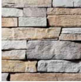
WEATHERED EDGE Fon-Du-Lac S5100-8