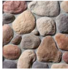
RIVER ROCK Minnesota Blend S4385-8