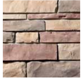
SANGRIA Tolono S4240-4