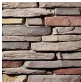
MONTANA LEDGE Ronan 54675-6