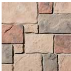
BAVARIAN CASTLE Nottingham S6270-10