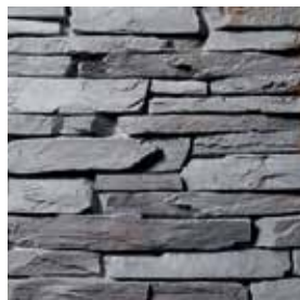
MONTANA LEDGE Rocky Mountain 54610-8