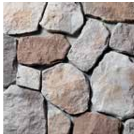
EASTERN FIELDSTONE Hampton S6020-5