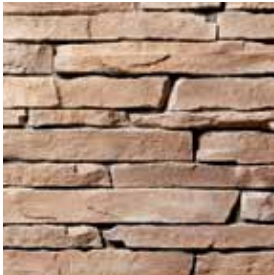
COUNTRY LEDGE Brown S4000-8

An irregular ledgerstone, roughhewn and informal with varying heights.