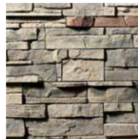
FAST STAK* Velarde S5025-7