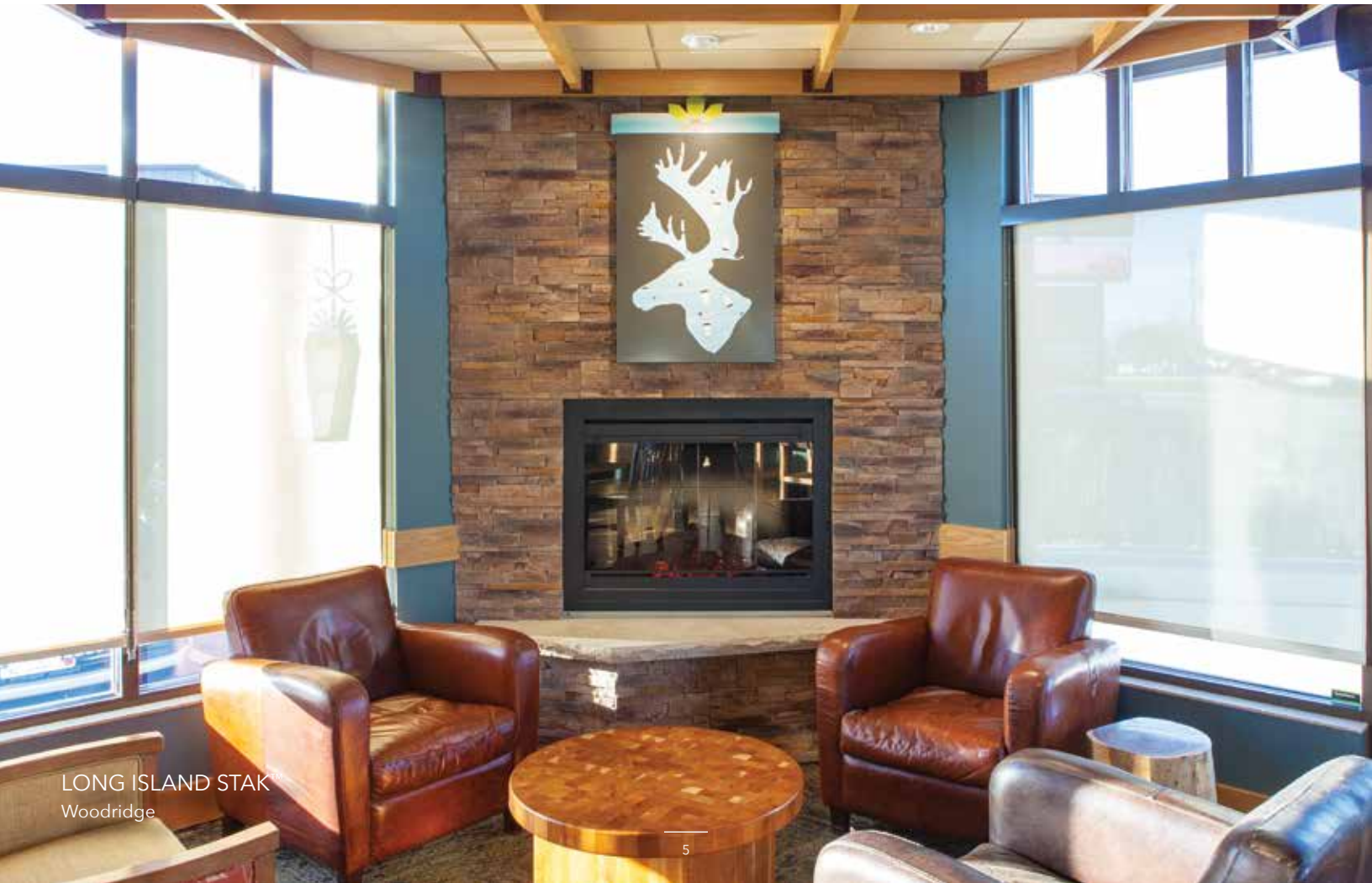
LONG ISLAND STAK Woodridge

*These items are special order only. Contact your local dealer or Boulder Creek Stone for lead times.