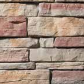
WEATHERED EDGE Sun Prairie S5110-8