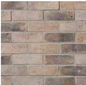
TRAVERTINE Crane 2200-07

Its visual divots and pock marks capture the timeless, classic design of brick.