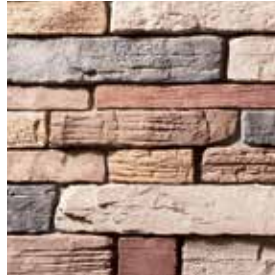
WEATHERED EDGE Trenton S5135-7