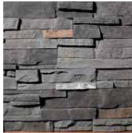
FAST STAK* Black Onyx S5035-09