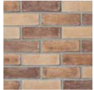
NEW BRICK Sienna Blend 2103-8