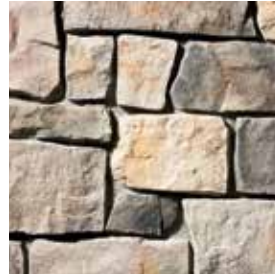
VENETIAN COBBLE Florence S5940-7