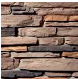
MONTANA LEDGE Chesapeake S4670-4

Rugged, sharp angles and distinct wear are illustrated in this stone.