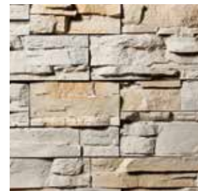
FAST STAK* Nema S5060-8