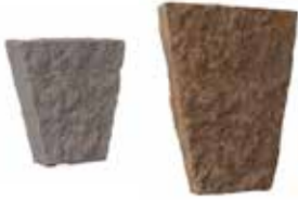
Keystone – Chisel Face

SIZES: 2 1/2" thick, small 8", large 12" COLORS: Antique Tan, Arkansas, Light Gray, Pewter Gray, Ponderosa, Tivoli