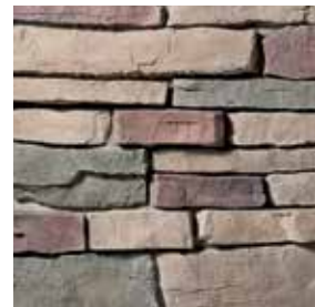
SOUTHEASTERN LEDGESTONE Crimson Mountain S6185-6