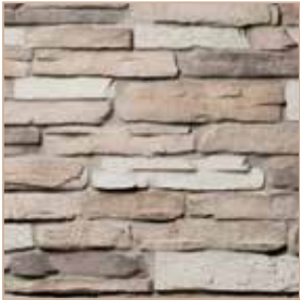
COUNTRY LEDGE Loveland S4040-14